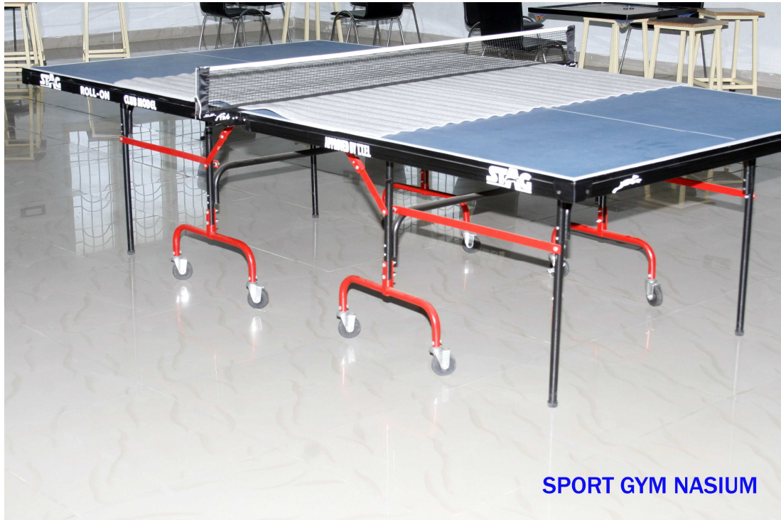
SPORT GYM NASIUM