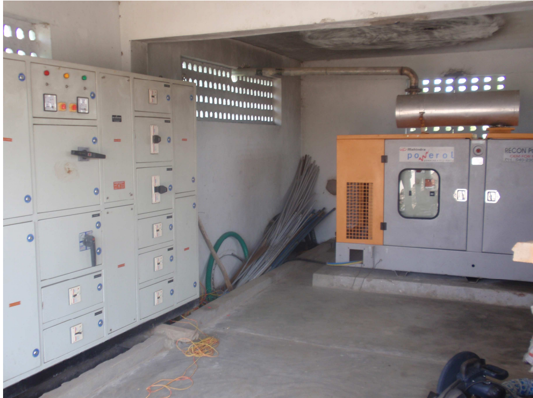
16. Boys Hostel